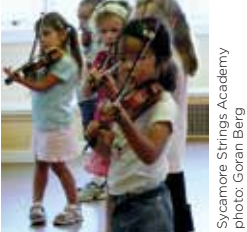
Sycamore Strings Academy

On any given day, the Bothwell Arts Center and Downtown Arts Studios are filled with artists coming together to further their art, give free rein to their vision, and support one another, providing a community to truly grow the arts in Livermore.