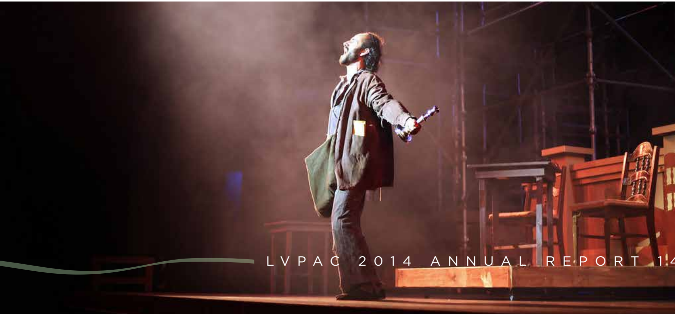
Tri Valley Rep - Les Misérables