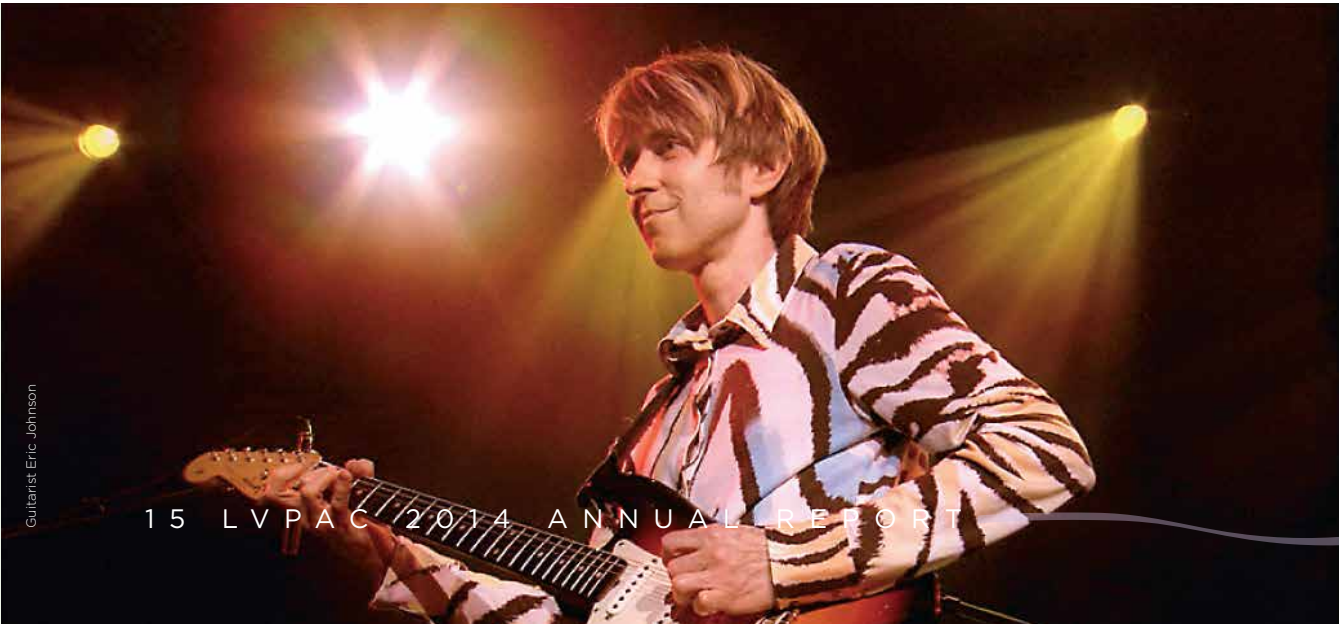
Guitarist: Eric Johnson